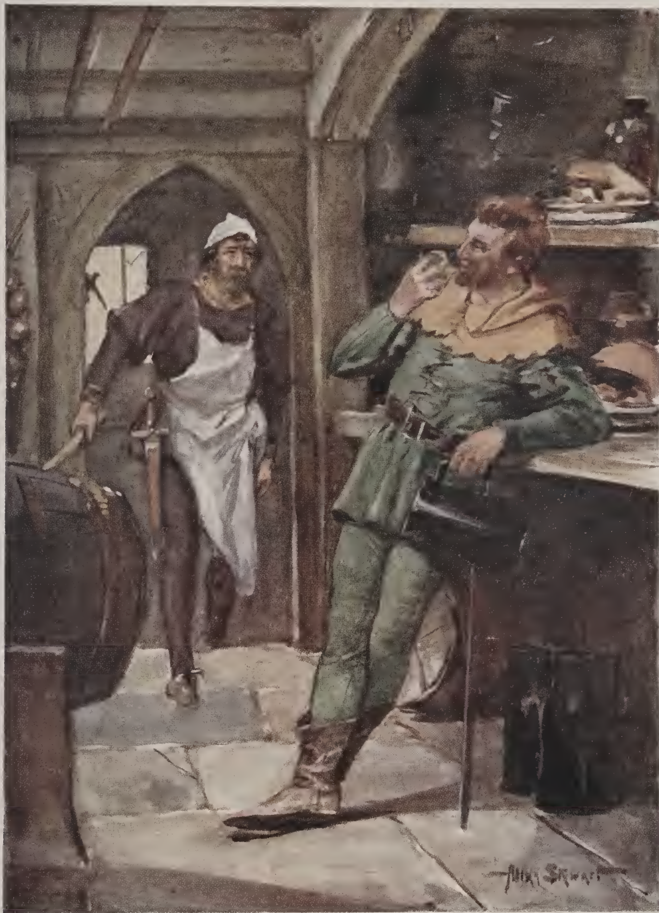
LITTLE JOHN RAIDS THE PANTRY.